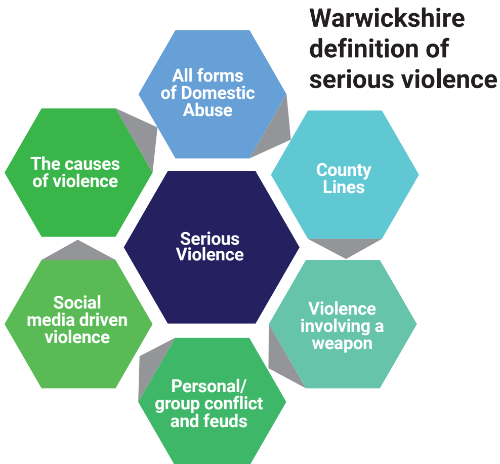
Figure 1 Types of serious violence covered the Safer Warwickshire Partnership Serious Violence Prevention Strategy

Figure 1 sets out the areas of serious violence that are covered in our strategy